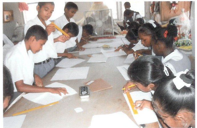
TOPS students learn to take measurements at GO

students from Corriverton Primary come over to GO's Vo-tech facility at the Skeldon Primary Annex for vocational training in sewing and crafts. The TOPS curriculum includes: hand-sewing, hand-embroidery, measurements and squaring the grainline of material. Also, students work with fabrics to make handkerchiefs, kitchen towels, basketballs, and lots more!