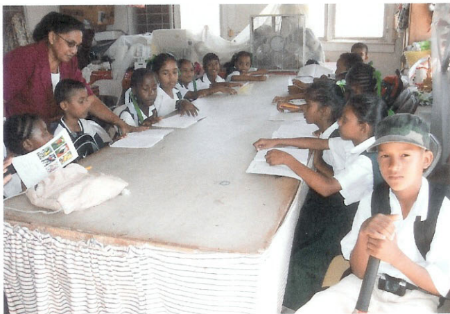
After School Reading Class at GO's Vo-Tech

GO's outreach into the community is exceeding our expectations. Currently, enrollment to date totals 107 youths in GO's After School Reading Programs. GO is ramping up to 300 students enrolled each week by January 2007. This aggressive ramp-up is driven by the enthusiastic response of parents and the community, and of course, the need is great.