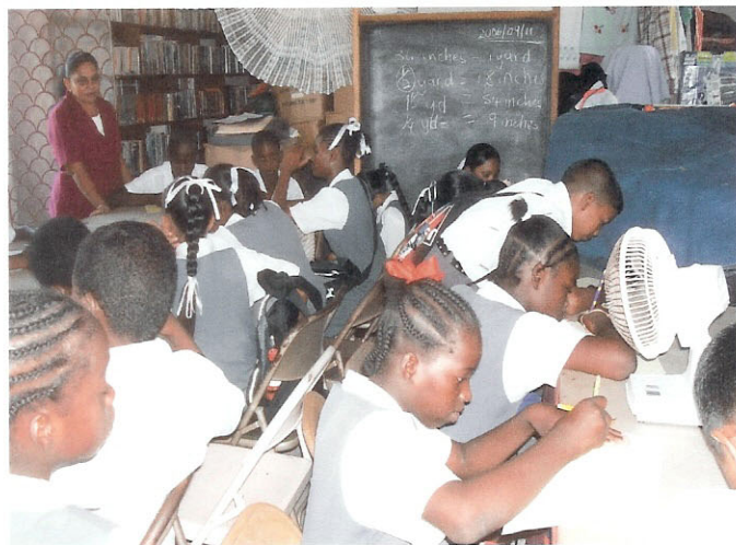
TOPS students at GO's Vo-tech classes

GO is experiencing tremendous growth and for which, we thank the Lord. GO responded to the request to reach further into the community. As a result of our success, we are bursting at the seams. Our two-room facility at the Skeldon Primary School Annex is over-crowded. One room houses our sewing department and the other our computer department.