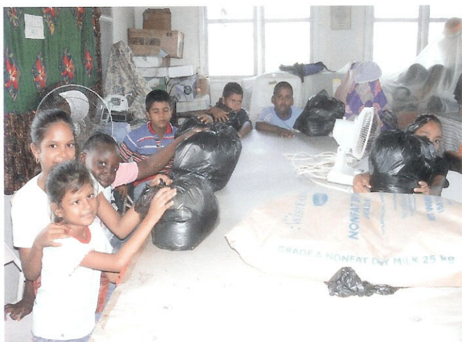
After School Reading students receiving items from GO through Food For The Poor