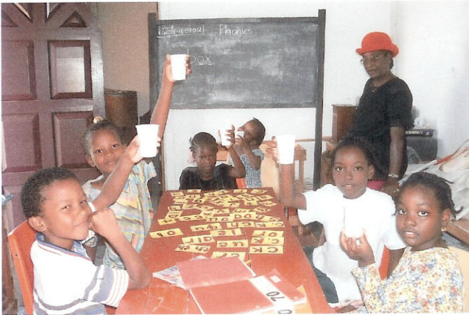
Starting After School Reading Program with a warm cup of milk at Streams of Power Church

GO's Literacy Project, commonly referred to as the After School Reading Program continues remarkable growth. Classes are in full swing now that the public schools are back in session. This term's enrollment is 107 and increases weekly. All of GO's classes are free except for some of the computer classes, which cost a minimal fee.