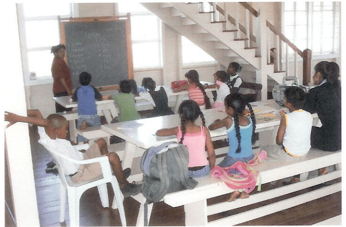
After School Reading students learn vocabulary at Skeldon Emmanuel Lutheran Church

All After School Reading classes start at 3:00. Classes are held at the following locations: Vo-tech facility at the Skeldon Primary Annex with 22 students; Skeldon Presbyterian Church, with 15 students; Skeldon Emmanuel Lutheran Church with 15 students; Streams of Power Church at No. 78 with 15 students; Massiah Presbyterian Church at No. 71 with 15 students; New Testament Church of God at No. 63 with 10 students; Full Gospel Church at No. 48 with 15 students.